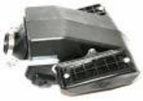
112.393.10 COMPLETE AIR BOX PLK FOR MIDI RRZ 2008-2010