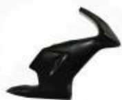
112.460.00 BODYWORK FIBERGLASS MIDI RRZ - RXM