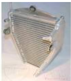
112.274.00 INCREASED PLK RACING RADIATOR (WITH SPACERS+ANTIVIBRATION RUBBERS)