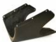
112.460.16 LOWER HALF-BODYWORK FIBERGLASS MIDI RRZ - RXM