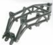
112.223.52 FRONT FRAME MIDI RRZ-3 WITH STEERING BEARINGS