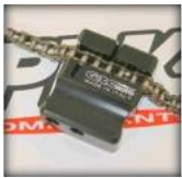
112.486.30 CHAIN BREAKER TOOL