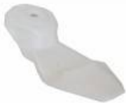
112.459.20 SADDLE MIDI RR MIX ABS WHITE