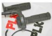
112.327.14 RAPID GAS CONTROL PLK WITH WIRE CARBURETTOR SH 14