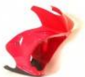
112.460.21 BODYWORK ABS MIDI RR MIX / MINI RX X3 RED 112.460.23 BODYWORK ABS MIDI RR MIX / MINI RX X3 BLACK 112.460.25 BODYWORK ABS MIDI RR MIX / MINI RX X3 OPAQUE BLACK