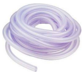
112.351.01 TRASPARENT PIPE FOR GREEN FUEL 5X10 1 METER