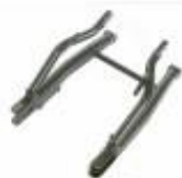
112.223.65 REAR FORKS MIDI RRZ-3