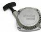
143.075.002 COMPLETE POLINI CRANKCASE IGNITION