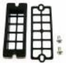
112.393.20 GRID + GRID COVER FOR AIR BOX PLK