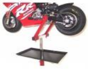
112.485.00 MINIMOTO WORKSHOP STAND (WITH FOOTBOARDS ATTACHMENT+REAR FORKS ATTACHMENT)