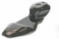
112.459.23 SADDLE MIDI RR MIX ABS BLACK