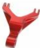
112.223.55 PROLINK MIDI RRZ-3