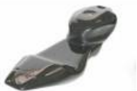
112.459.25 SADDLE MIDI RR MIX ABS OPAQUE BLACK