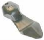
112.459.14 SADDLE MIDI RRZ-3 FIBERGLASS