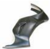
112.460.03 BODYWORK FIBERGLASS MIDI RRZ-3