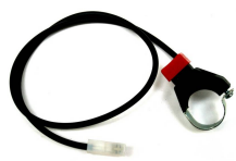
112.340.00 STANDARD STOP BUTTON