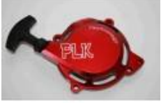
115.017.05 CRANKCASE STARTING CNC RACING PLK FOR BZM-IAME ENGINE