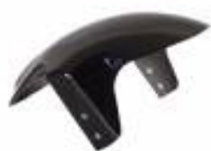
112.453.10 FRONT MUDGUARD FIBERGLASS