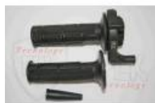
112.327.10 RAPIDO GAS CONTROL PLK