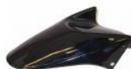
112.455.10 BACK MUDGUARD ABS