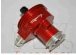
112.010.67 INCREASED UNIVERSAL PLK WATER PUMP D.35 WITH REDUCED PULLEY