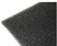
112.393.22 SPONGE SHEET FOR AIR BOX PLK (240x300 mm.)