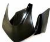
112.460.12 UPPER HALF-BODYWORK FIBERGLASS MIDI RRZ - RXM