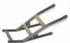
112.223.70 ALUMINIUM SADDLE SUPPORT MIDI RRZ-3